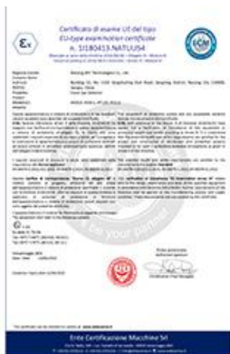
ATEX Certificate certificate